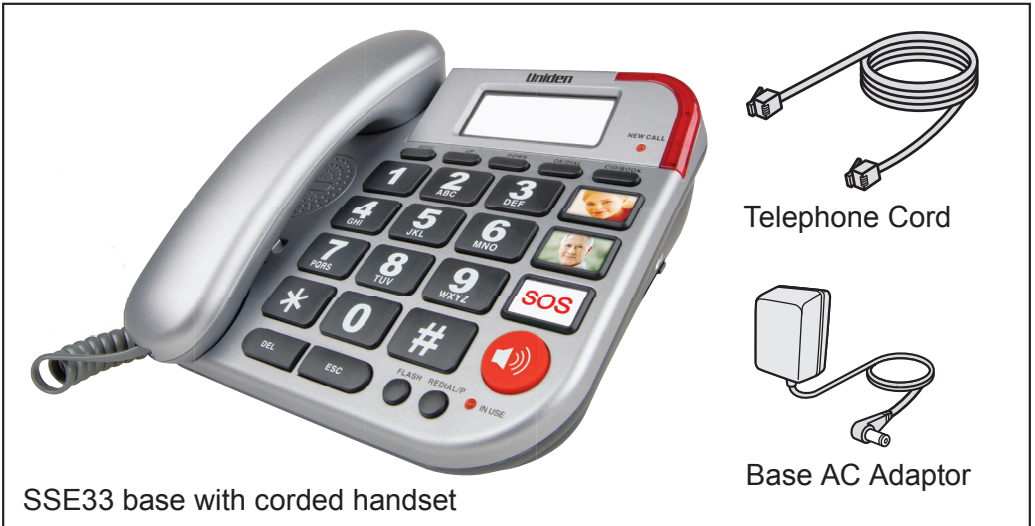
SSE33 base with corded handset