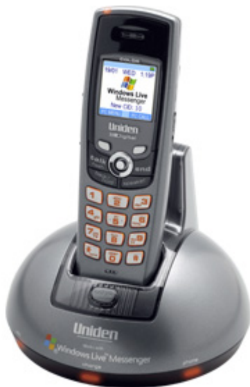
Angle View Front View Handset View

73 Alfred Road Chipping Norton 2170 NSW Tel: 02 9599 3355 | Fax: 02 9599 4018 www.uniden.com.au